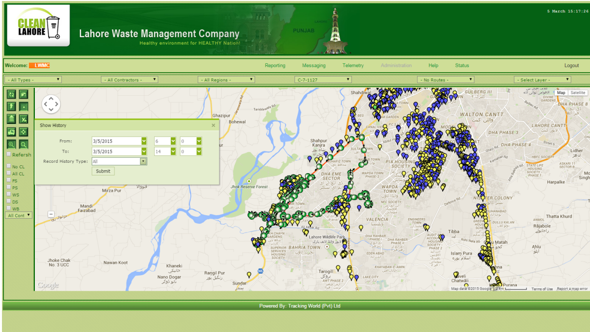
Compactor Route 1127