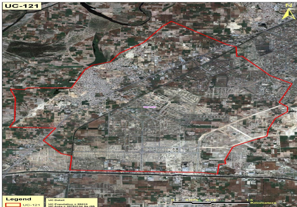
Figure 1: Map of UC 121 Chung

Union Council – 121 (Chung) is located in Allama Iqbal Town. Total area of the UC is 20783134 m 2 with population of 55010. This area is predominantly middle income area with planned settlement.